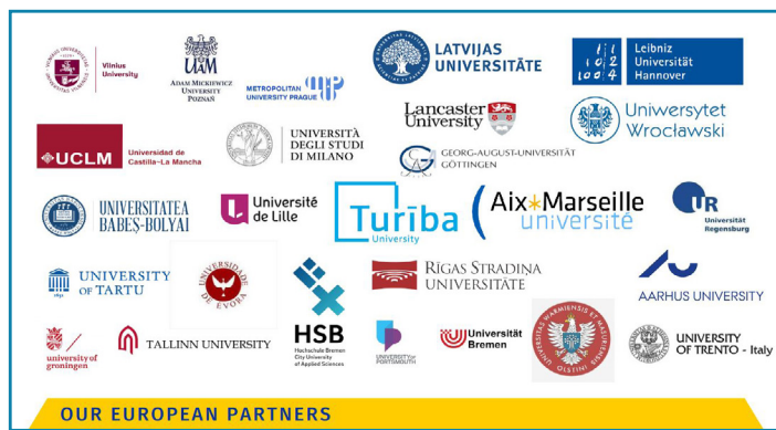
OUR EUROPEAN PARTNERS

International Collaboration – MCES has Memoranda of Understanding (MoUs) with several European universities which facilitate mobility of students and staff between India and Europe.