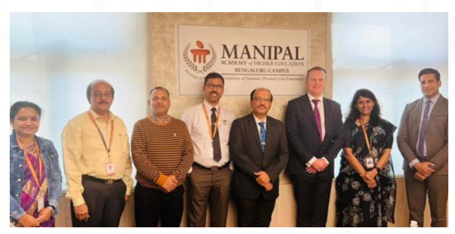
University of Bristol