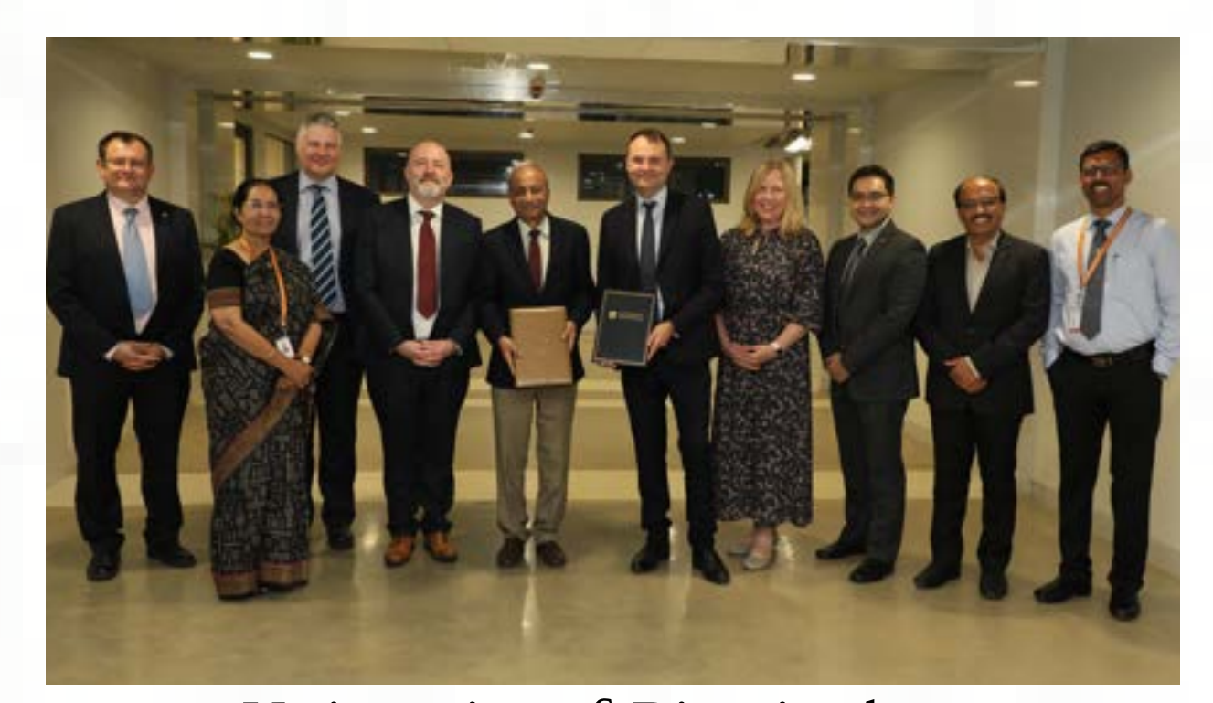
University of Birmingham