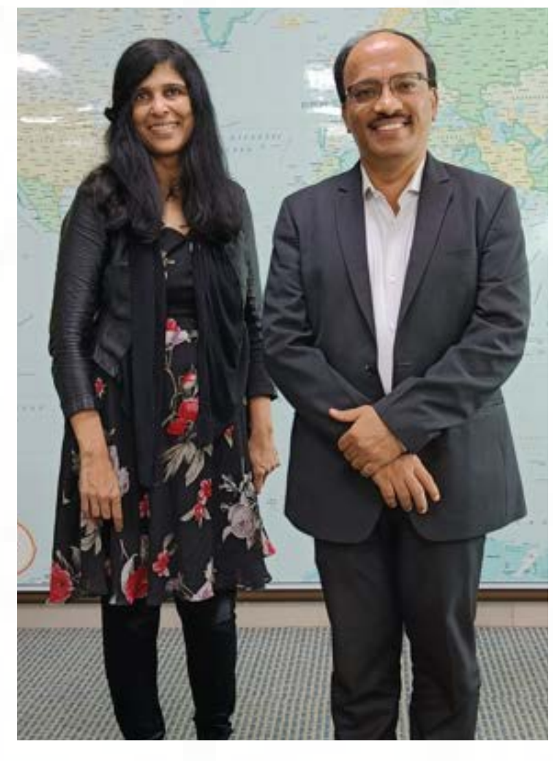
Nova Scotia Health