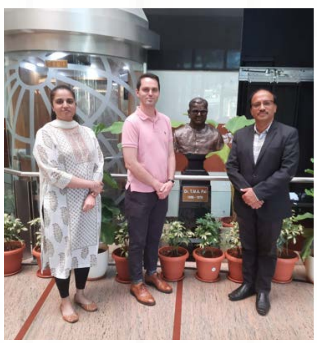
University College Cork, Ireland