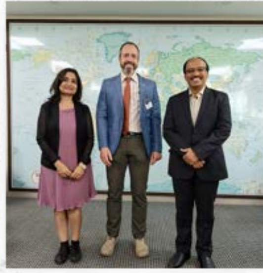
University of Manchester