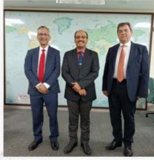
University of London