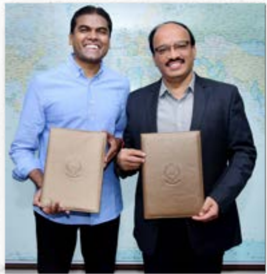
Leibniz University Hannover