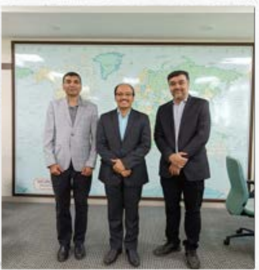
Virginia Commonwealth University