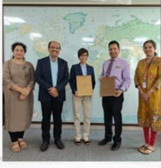
University of South Florida