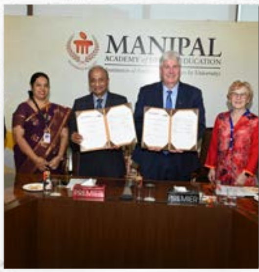
University of New Brunswick