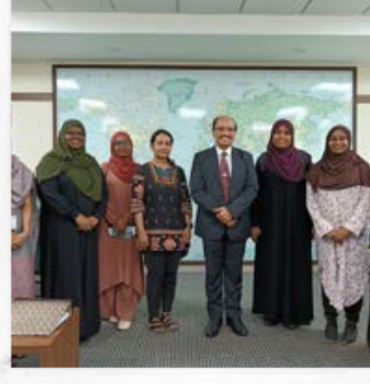
University of Maldives