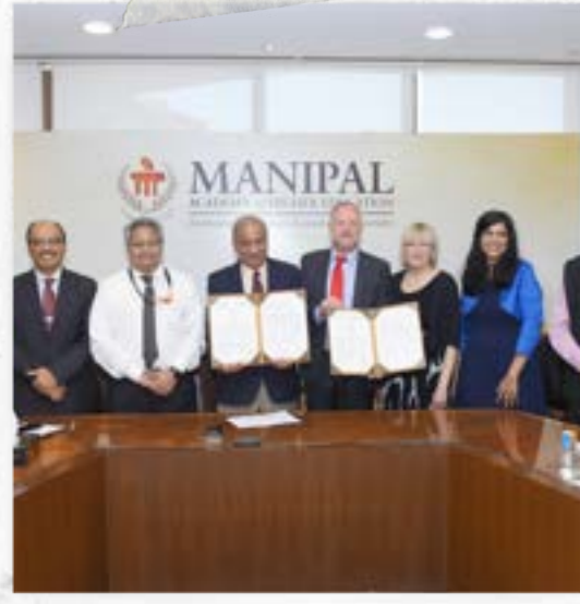
Dalhousie & NOva Scotia