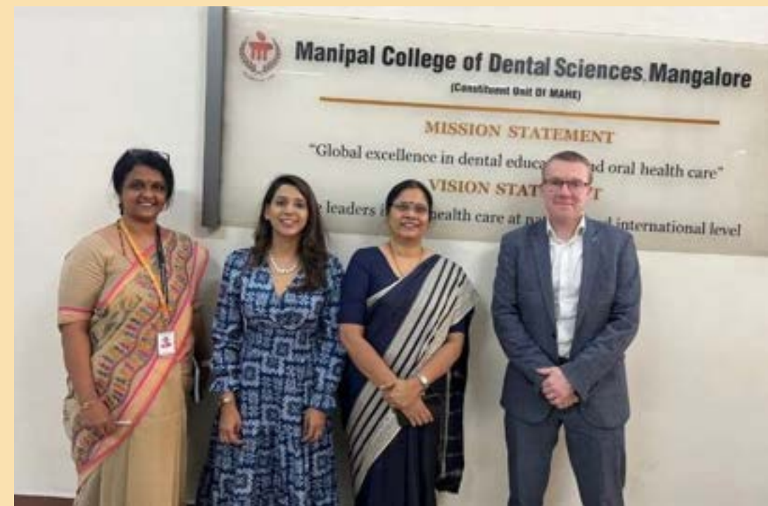
University of Portsmouth, England