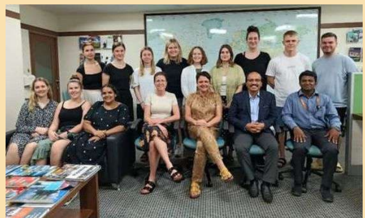
University College of Northern Denmark Denmark