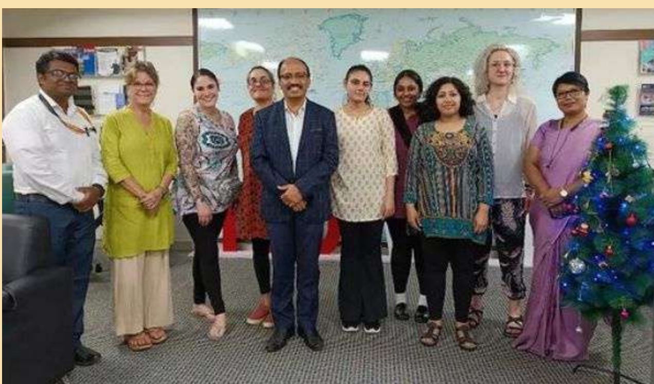
MGH Institute of Health Professions, USA