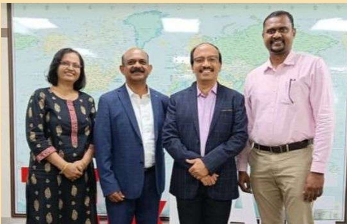
James Cook University, Singapore