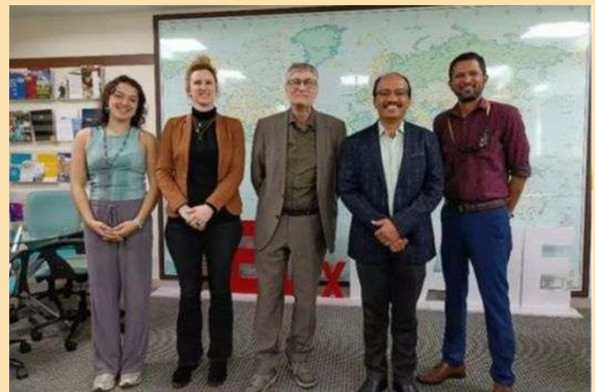
Hogeschool Utrecht, Netherlands