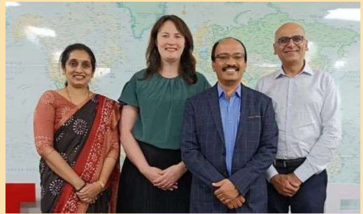
University of Melbourne, Australia