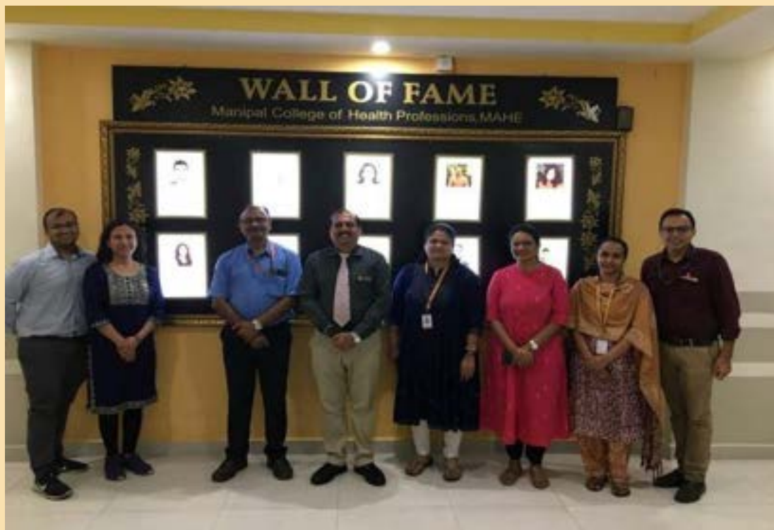
Georgia State University, USA