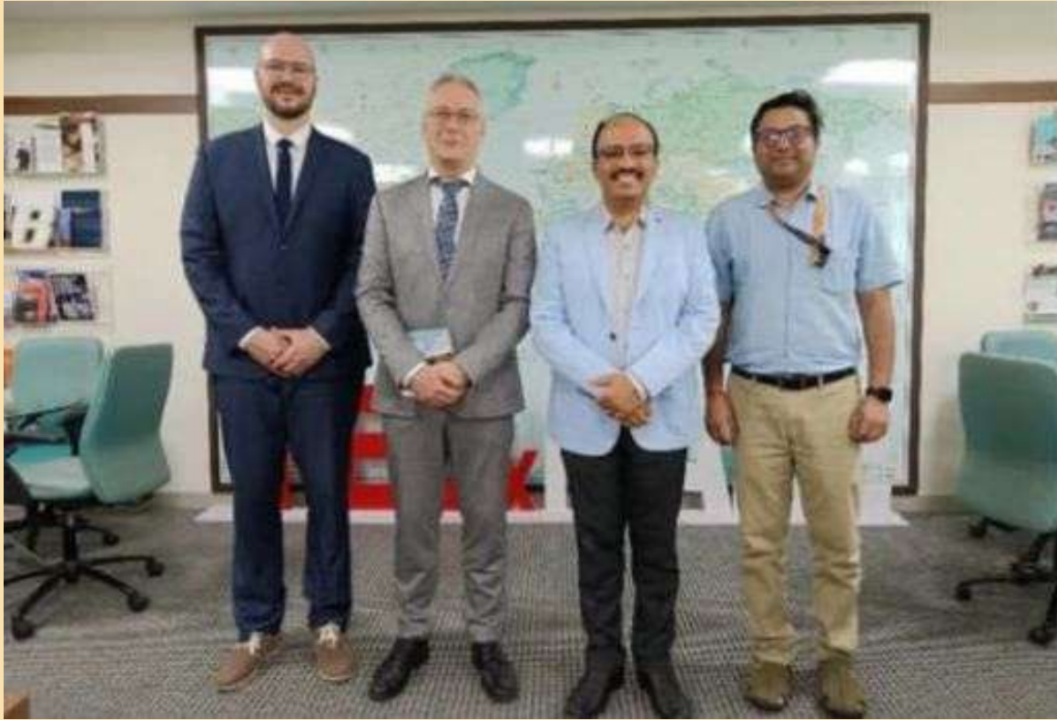
Erasmus University Medical Center, Netherlands