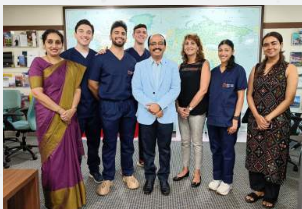
School of Dental Medicine, Boston University