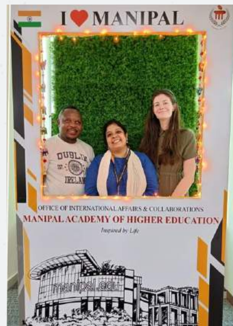
University of Huddersfield, UK