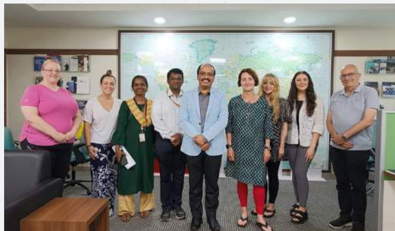
Edge Hill University, England