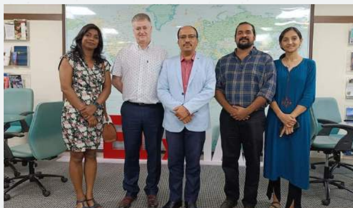
Scottish Biologics Facility University of Aberdeen