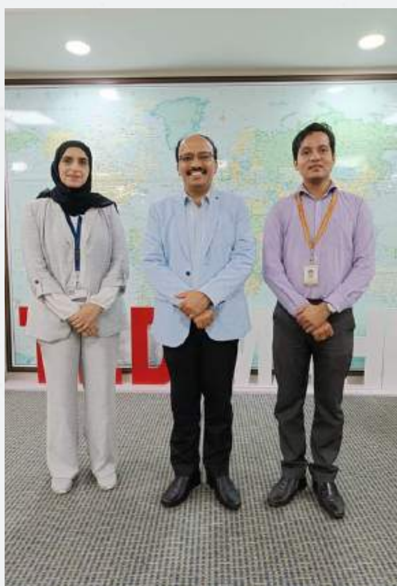
National University of Science & Technology, Oman