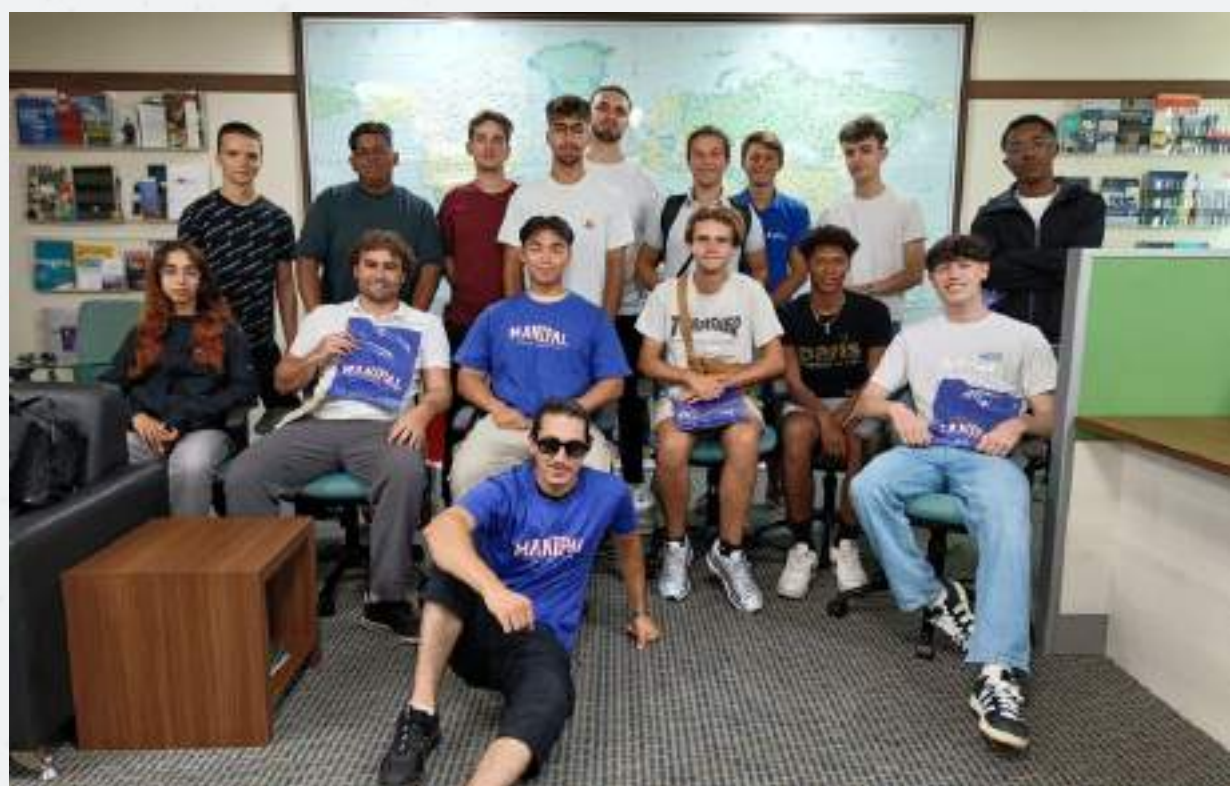
Efrei Paris students for a semester exchange at MSIS