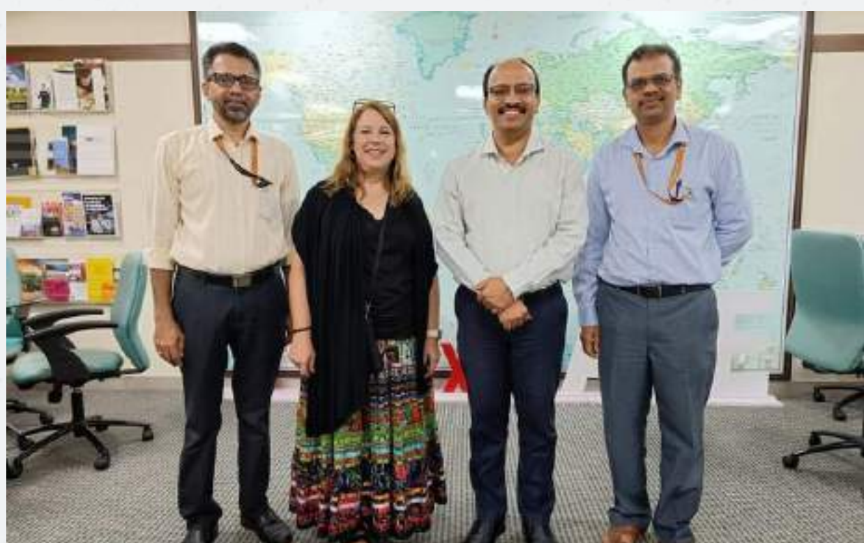
School of Pharmacy and Pharmaceutical Science Binghamton, New York