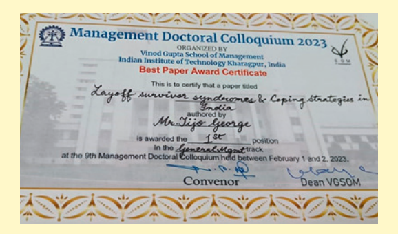
Best Paper Award: Tijo