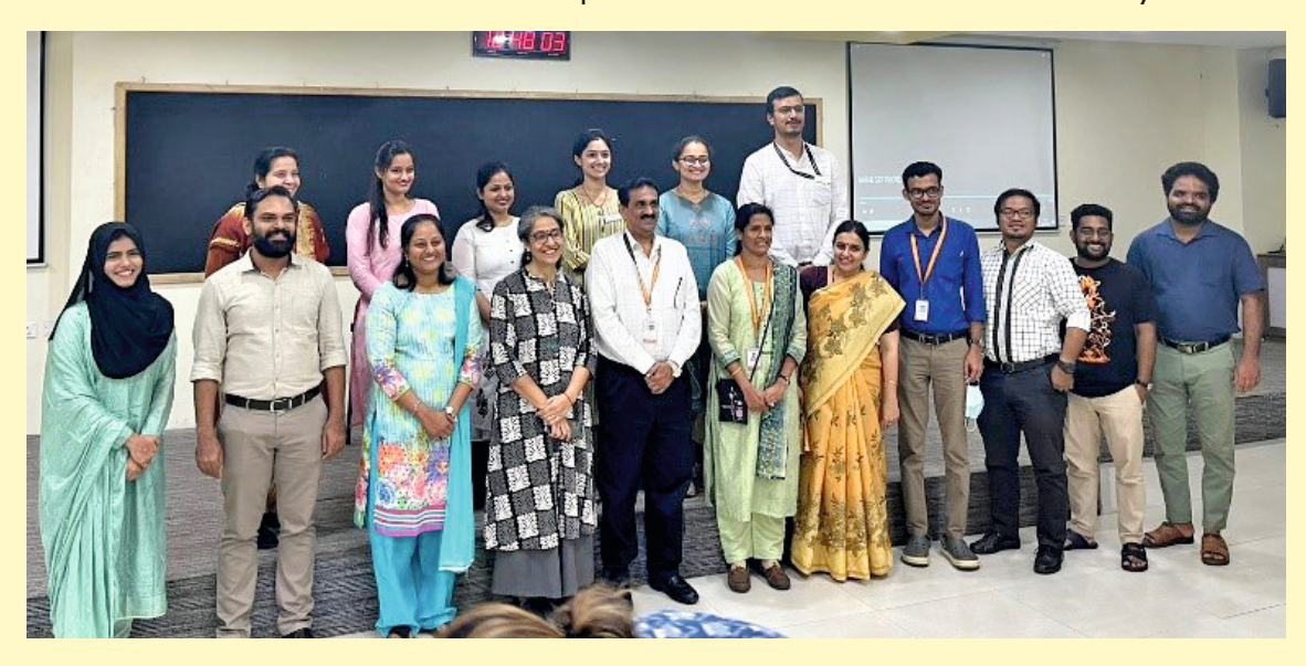
MAHE SRF 2022 Members

enthusiasm and dedication. The upcoming quarters promise to be filled with proactive initiatives and collaborative efforts to enhance the overall experience within the MAHE community.