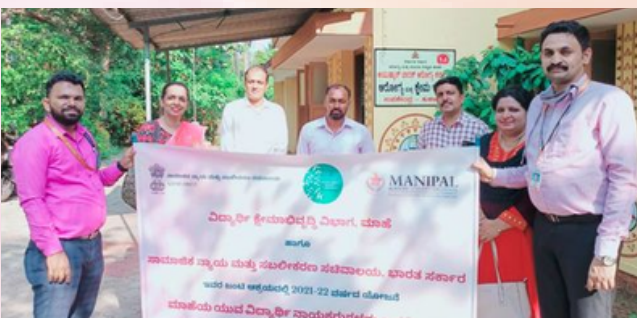
(Above) NMUA team visit the Primary Health Sub-Center, Kurkalu on April 26, 2022