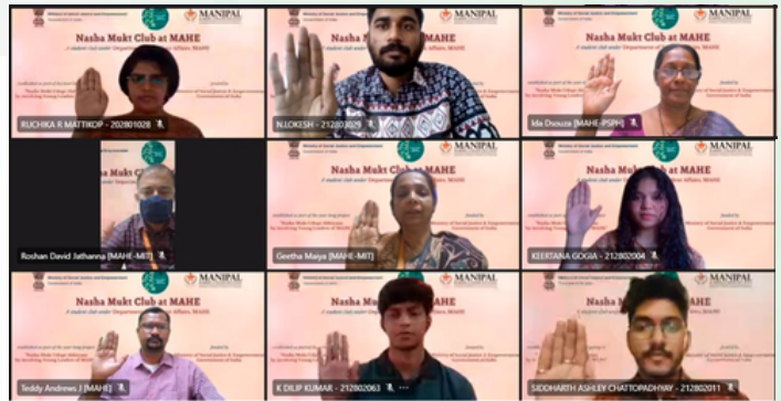
(Below) NASHA MukT Club at Prasanna School of Public Health inaugurated on Jan. 18, 2022