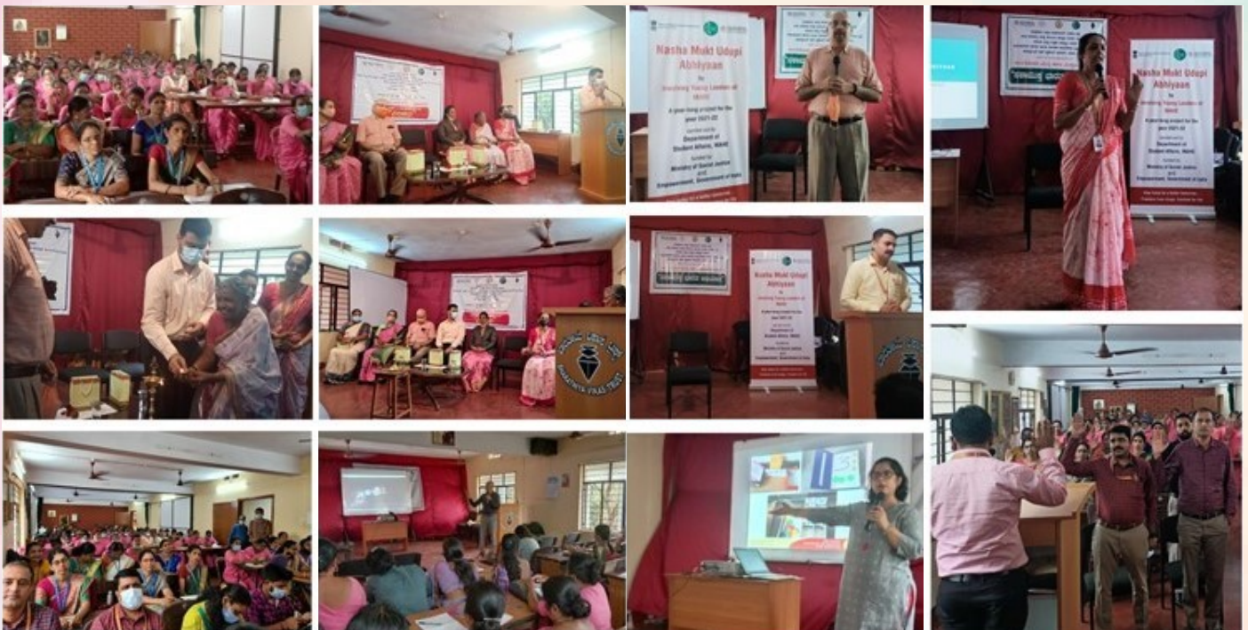
Workshop on Autism Awareness & Orientation to Nasha Mukh Bharath Abhiyaan for Asha Karyakarthis and Anganawadi Supervisors at the Bharathiya Vikasa Trust on March 23, 2022.