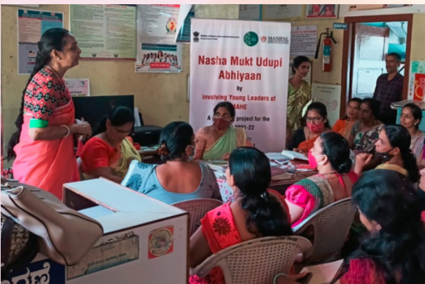
(Above) Addressing the Anganawadi Workers at Moodbettu on April 26, 2022