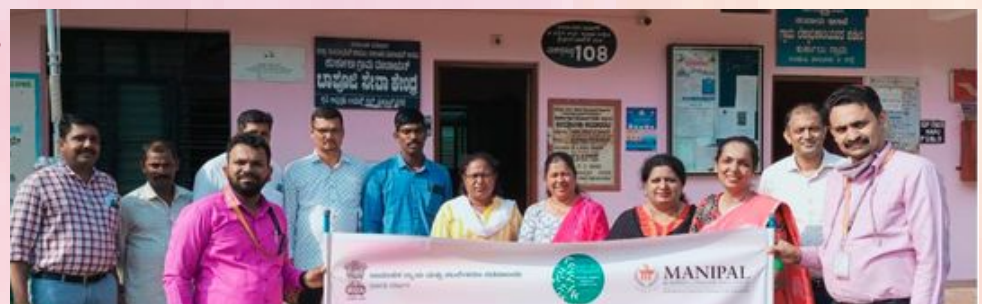
(Below) NMUA team at the Kurkalu Grama Panchayath on April 26, 2022