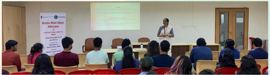
(Above) Planning community awareness programs with student volunteers on May 30, 2022