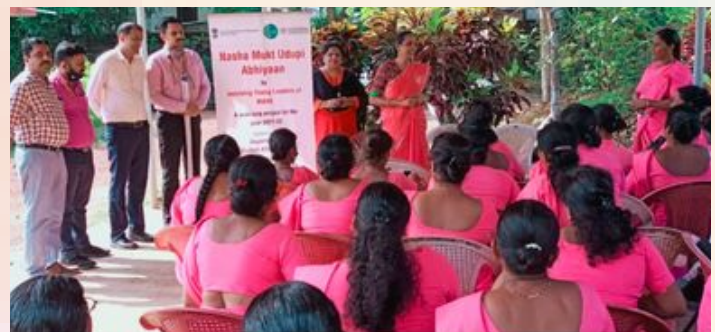
(Above) Addressing the Asha Workers at Moodbettu on April 26, 2022