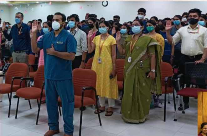
(Above) NASHA MukT Club at Manipal College of Health Professions inaugurated on Mar. 3, 2022