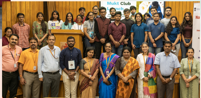
(Above) NASHA MukT Club at Manipal Institute of Technology inaugurated on Mar. 28, 2022