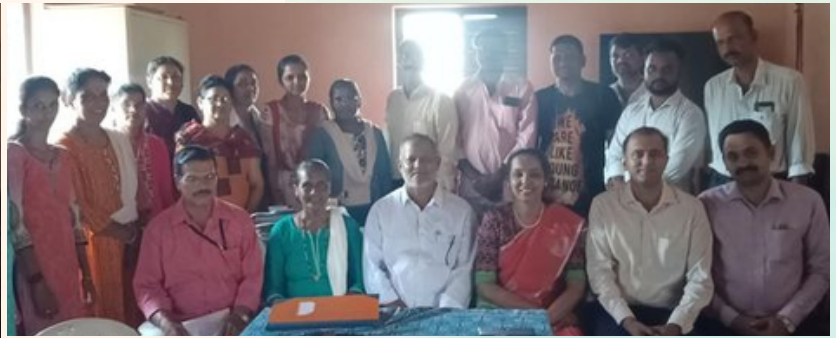
(Left & Above) NMUA team at Manipura Grama Panchayath on April 26, 2022