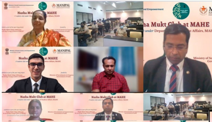
(Above) NASHA MukT Club at Welcomgroup Graduate School of Hotel Administration inaugurated on Jan. 29, 2022