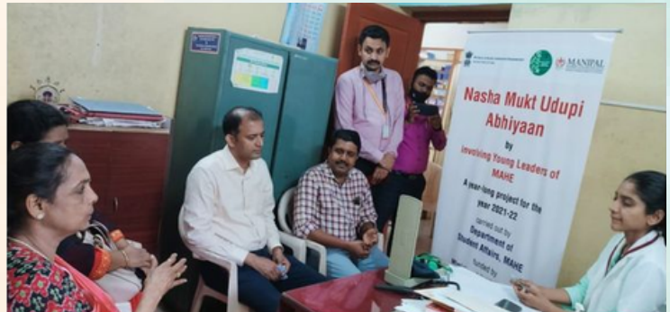
(Right) Discussion with doctors at Primary Health Center, Moodbettu on April 26, 2022