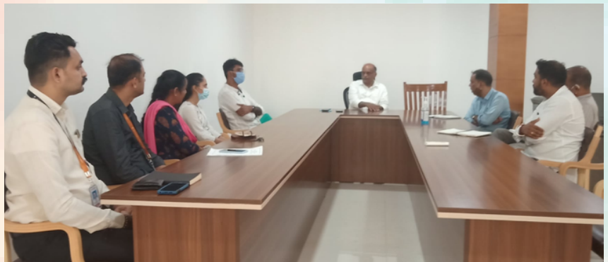
(Right) Meeting with District Health Officer on Mar. 16, 2022 to plan community awareness programs