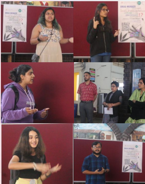
(Above) Students & faculty of Manipal School of Architecture & Planning conducting a Debate on "Mental stress and depression is the root cause of substance abuse in today's youth" on May 20, 2022