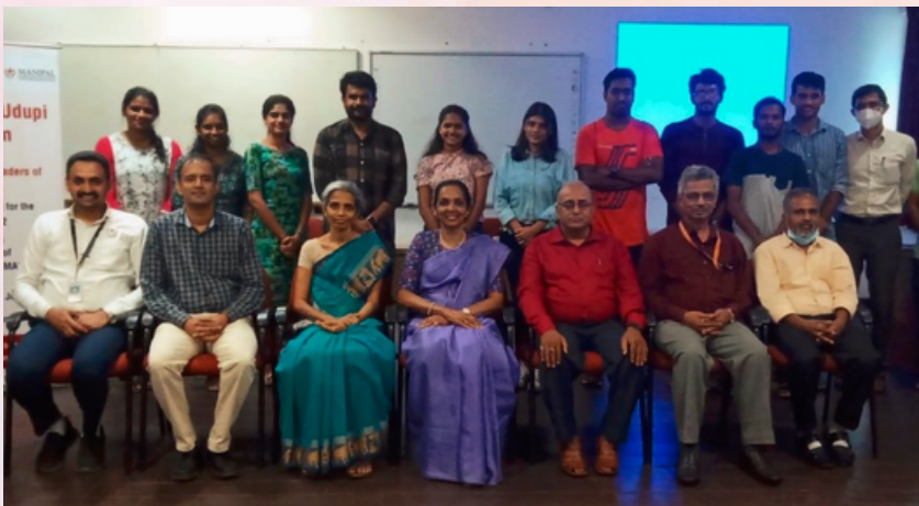
(Left) NASHA MukT Club at Manipal School of Information Sciences inaugurated on May 7, 2022