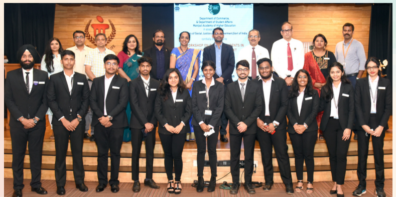
(Above) Nasha Mukta Club at Department of Commerce inaugurated on Nov. 17, 2021

"I hereby pledge to make MAHE campus Nasha Mukta by staying away from illicit substances and involving myself wholeheartedly in all the efforts undertaken by MAHE towards this noble cause. Jai Hind."