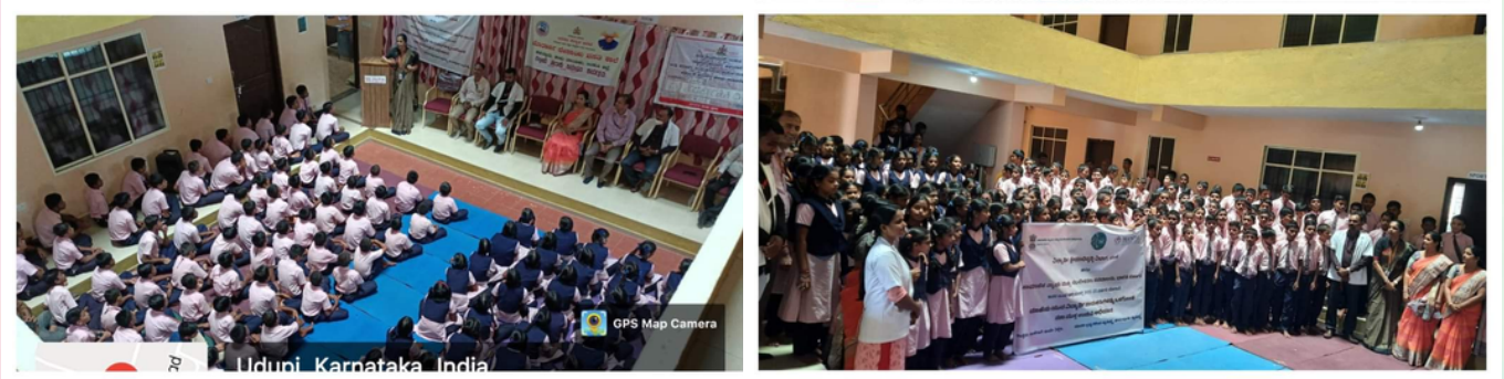
(Above) The NMUA team in association with the Government of Karnataka, Minority Welfare Department, Kaup Taluk, Zilla Panchayath Udupi, National Health Mission, District Health & Family Welfare, Moodabettu Primary Health Sub-Center, National Tobacco Control Programme organized an awareness talk on the effects of drugs at Morarji Desai Residential School, Kalathuru on June 10, 2022

The NMUA team, along with selected students trained during the Peer Support Workshop and local leaders, visited the following regions of Udupi district: Subhashnagar, Madaga, Shankarpura, Kundapura, Biliyaru, Manipura, Giliyaru, Thekatte, Kumbashi, Manoor and Kotathattu. The team conducted a door-to-door visit, speaking to the residents about the ill effects of substance abuse and distributed flyers containing useful information to overcome this addiction.