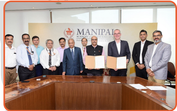
MOU signing between MAHE, Manipal and Novo Nordisk Service Centre (India) Private Limited, (Health Science)