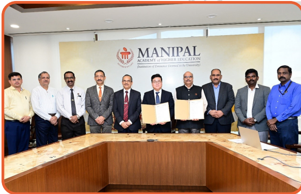
MOU signing between MAHE, Manipal and 3BIGS Co, Ltd, (Science and Technology)