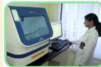
Modified Sanger sequencing machine-ABI 3500 XL genetic analyser