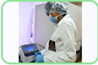
Counting Cells in Countess 3 automated cell counter