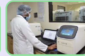
Multiplex real-time PCR platform