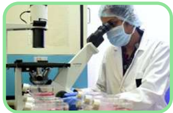
Microscopic Observation of cell line