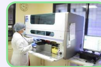
Automated nucleic acid extraction unit