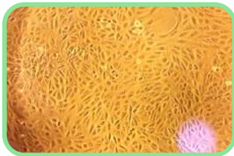
Cell line visualized under inverted microscope