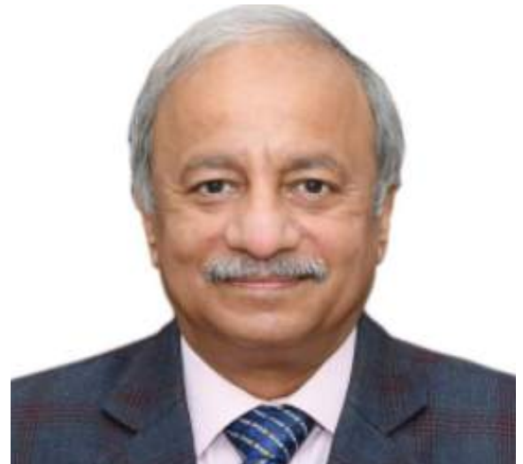
Lt Gen Dr M D Venkatesh Vice Chancellor MAHE, Manipal

National Education Policy (NEP) 2020 as we understand is a step in the right direction signaling new normal. NEP 2020 clearly states that internationalization is one of the major objectives to promote knowledge and cultural exchange. What is exciting about NEP is that the government has realized that India can be a hub of a world-class education with the pursuit of excellence. Some of the major reforms recommended are facilitating research/teaching collaborations and faculty/student exchanges with high-quality foreign institutions and the signing of MoUs with foreign countries for mutual benefit. High-performing Indian universities will have an opportunity to set up campuses in other countries. Likewise, those from among the top 100 foreign universities will be invited to operate in India. NEP allows the credits transfer system as per the requirements of each HEI for the award of a degree. Furthermore, research collaboration and student exchanges between Indian and global institutions will be promoted through special efforts. The sole purpose is to promote India as a global study destination provi-