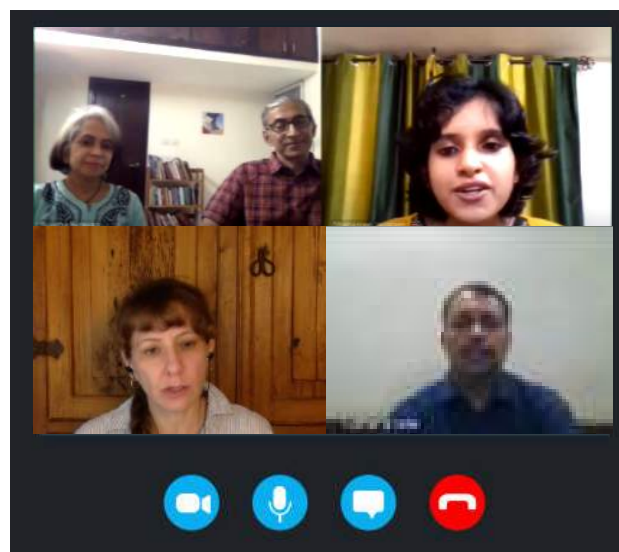
Screenshots from the webinar