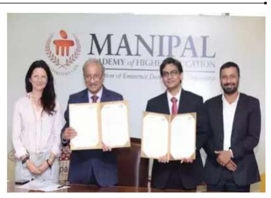
Celebration of Polish Science Day at MAHE

On 19 February 2021, the Office of International Affairs and Collaborations (OIAC) and the Department of Languages had organised the Polish Science Day celebration, and announced the inauguration of the National Agency of Academic Exchange