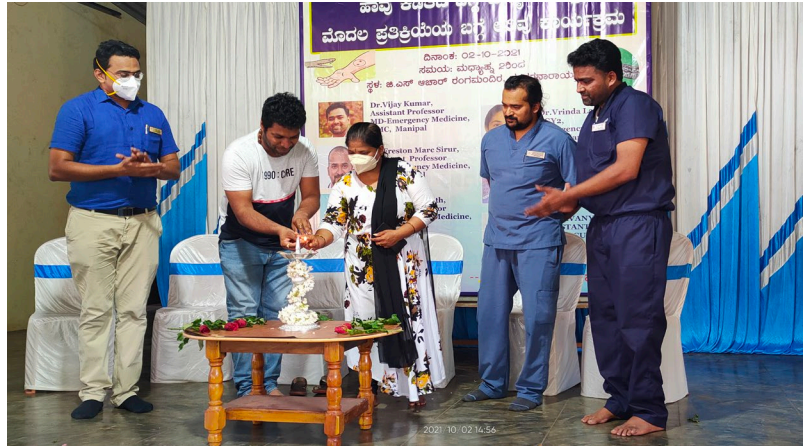
Lamp lighting ceremony