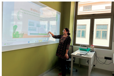
Workshop on biophilic design