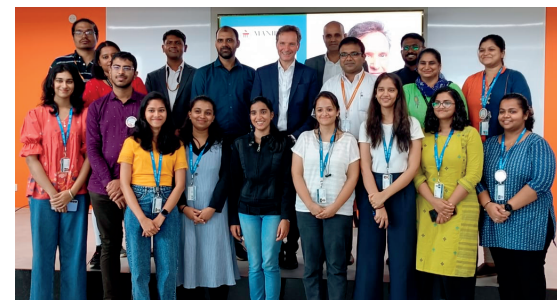
Session with Hertie School, Germany