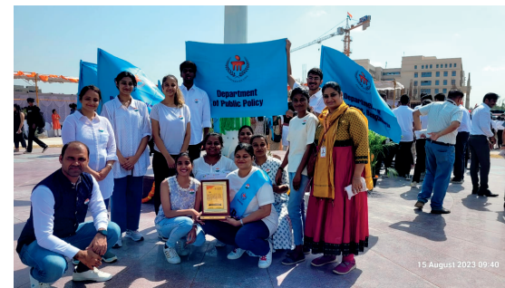
Independence Day 2023