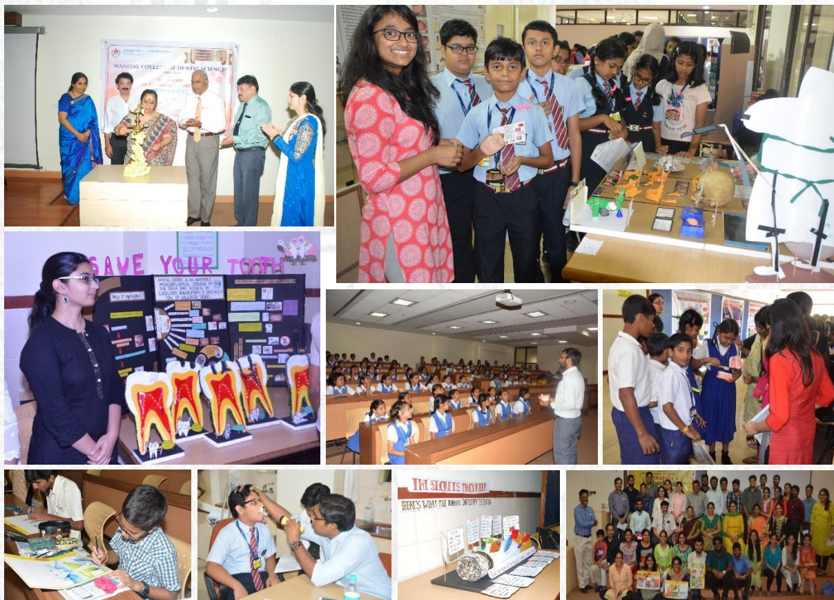
Glimpses of Dentofest