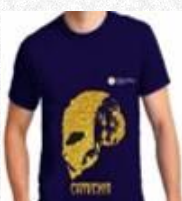
Interns & Postgraduates