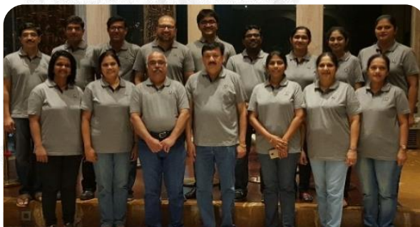
Admin Matters at Meridian!!

The annual retreat of the Heads of the Departments was held on the 9 th and 10 th December, 2017 at UVA Meridian, Kundapura.