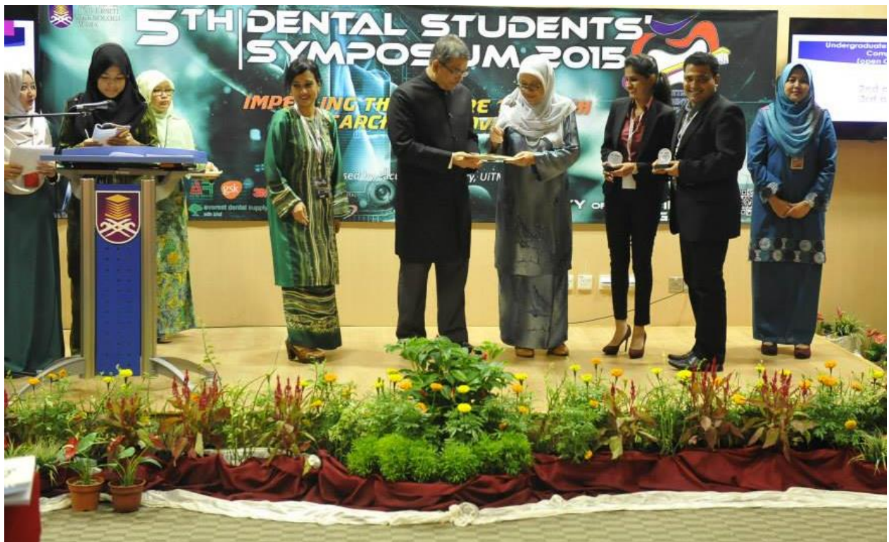
Student Exchange Program with Universiti Teknologi Mara, Malaysia