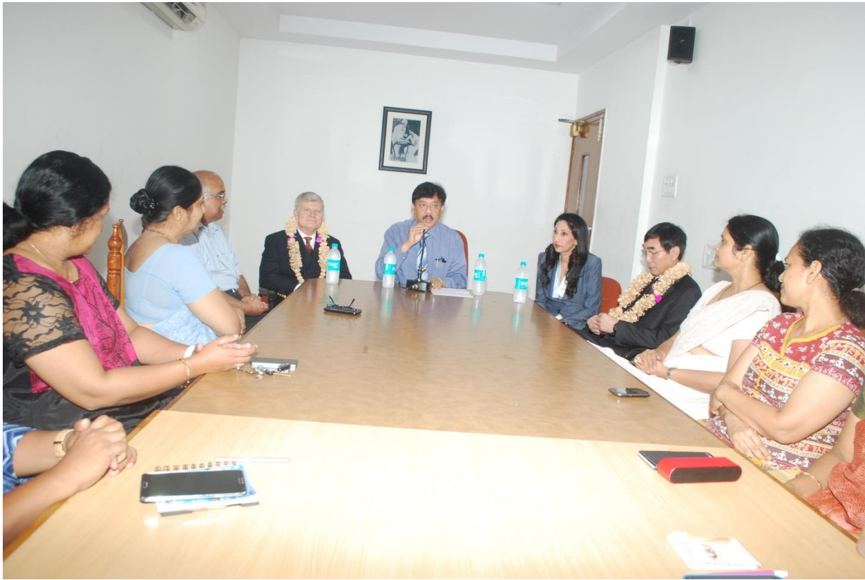
Preliminary meeting for Student Exchange Program with Boston University