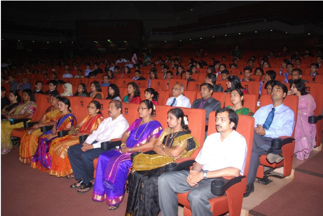
Air conditioned Auditorium and Conference Hall