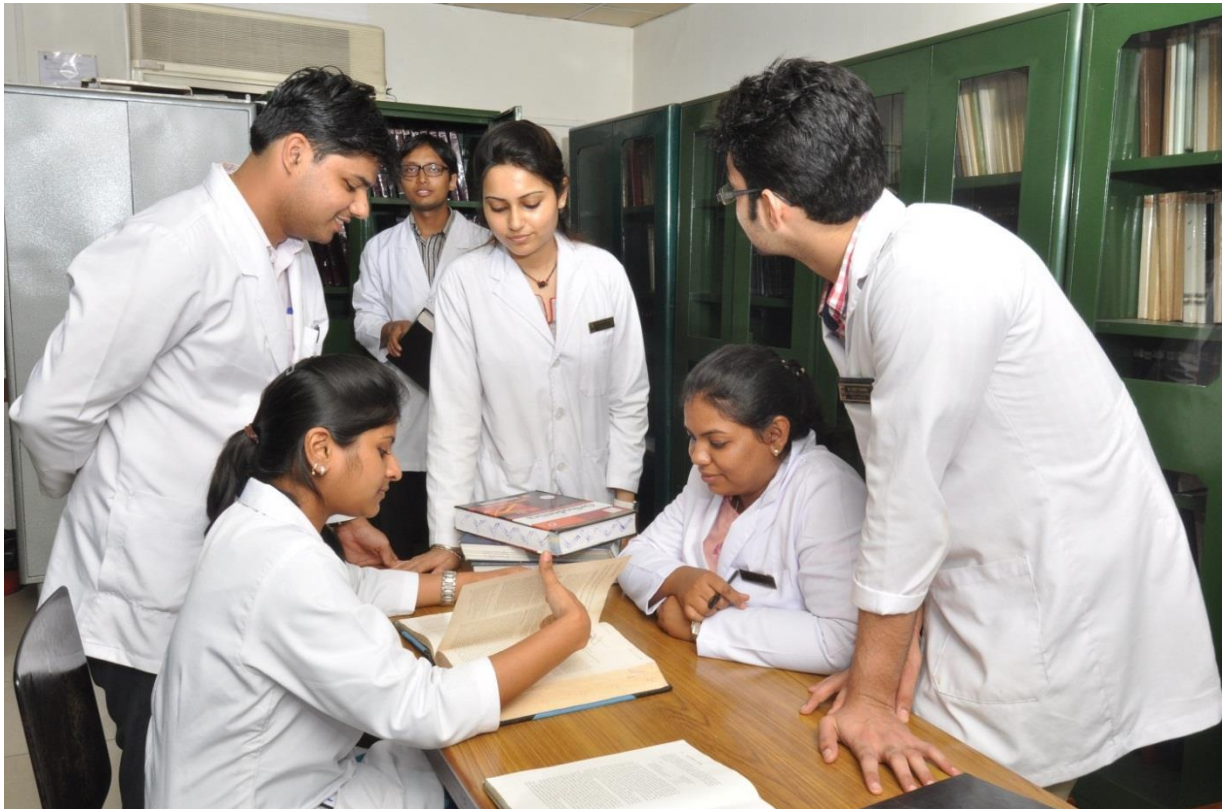
Air conditioned Reading Rooms