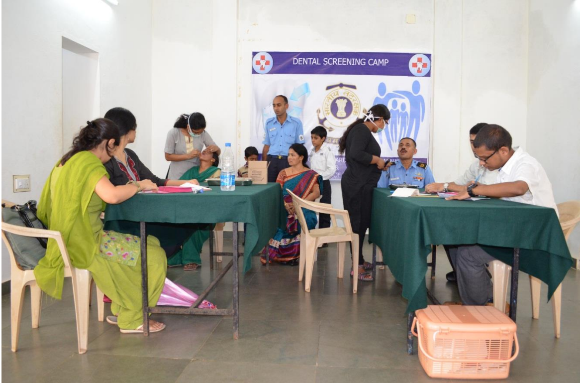
Community Outreach Program