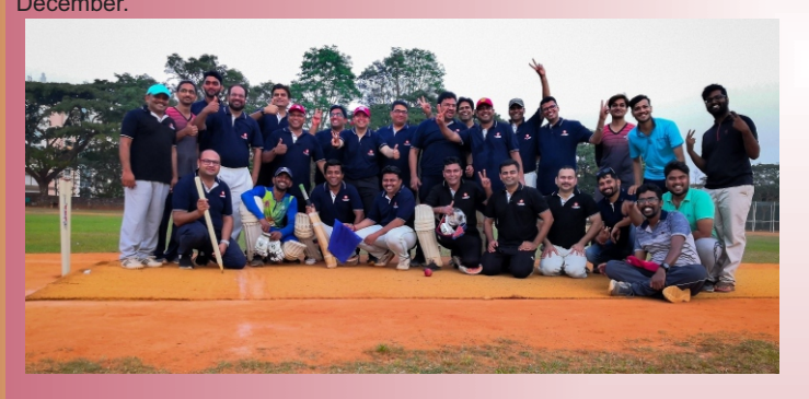
Manipal Pharmacy Conclave 2019

Twenty five alumni from different batches of MCOPS with cricket being the . passion came down to Manipal for the 2nd edition of re-union cricket match-MCLR 2.0-MCOPS Alumni Cricket Lovers Reunion 2.0 on December 29, 2019 at MAHE, Manipal. In the morning, a campus tour was organized followed by a hard ball 20-20 cricket match at MIT Cricket Ground, Manipal. An alumni reunion and fellowship was organized in the evening. Alumni had initiated and organized a half day Continuous Pharmacy Update and skill building activity for Pharmacy students titled- "Manipal Pharmacy Conclave" on the 30th of December.