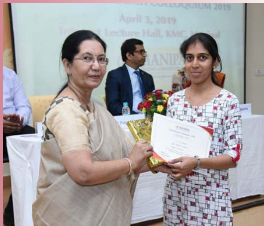
Best Poster Award