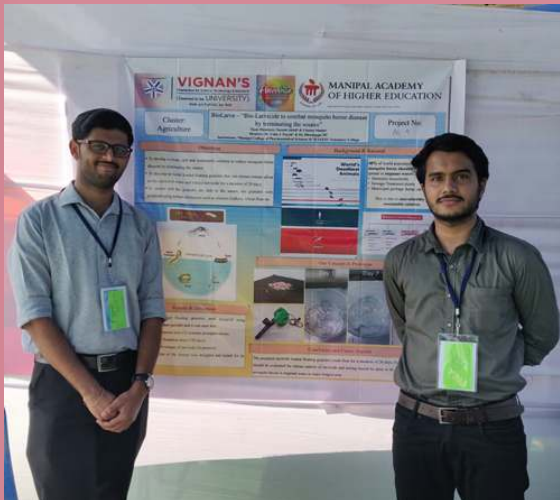
Best Poster Award