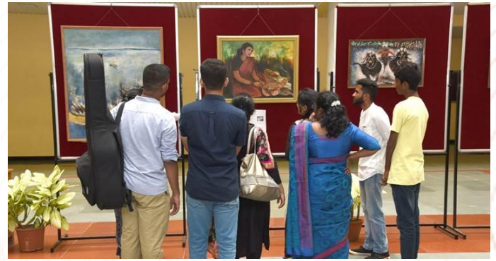
CCCS Exhibition dedicated to the art works of senior artists (born prior 1947)