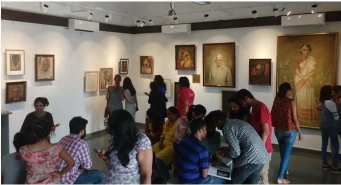
CCCS guided visit to the MAHE KK Hebbar art gallery (HGAC) Art Collections

In the past, the Centre has also procured grants from India Foundation for the Arts to collaboratively work with government schools to support the migrated and displaced communities. Project 'Nature and Culture' was one such project that contributed to social impact by creating awareness on challenges and issues of government school education. With the immense support from NGOs and Government officials, the project conducted significant activities and engaged the educators, stakeholders, activists and parents for active discussions and debates. Other outreach activities by the center include the 'Reaching the un-reached' project which supported financially challenged school children by arranging special classes on education through creative engagements.