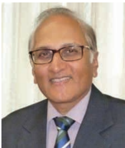
Hon'ble Justice S Ravindra Bhat Former Judge Supreme Court of India