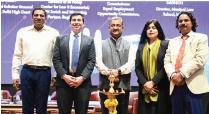
Dr. TMA Pai Policy Summit on AI & Privacy 24th February 2024