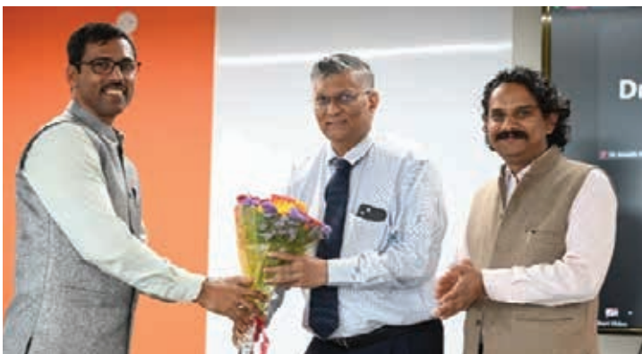
Digital Society Day | Industry-Academia Roundtable Discussion on Cybercrime | 17th Oct 2023