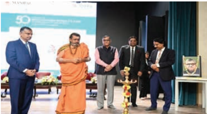
50th anniversary of Kesavananda Bharti's Case on November 18, 2023