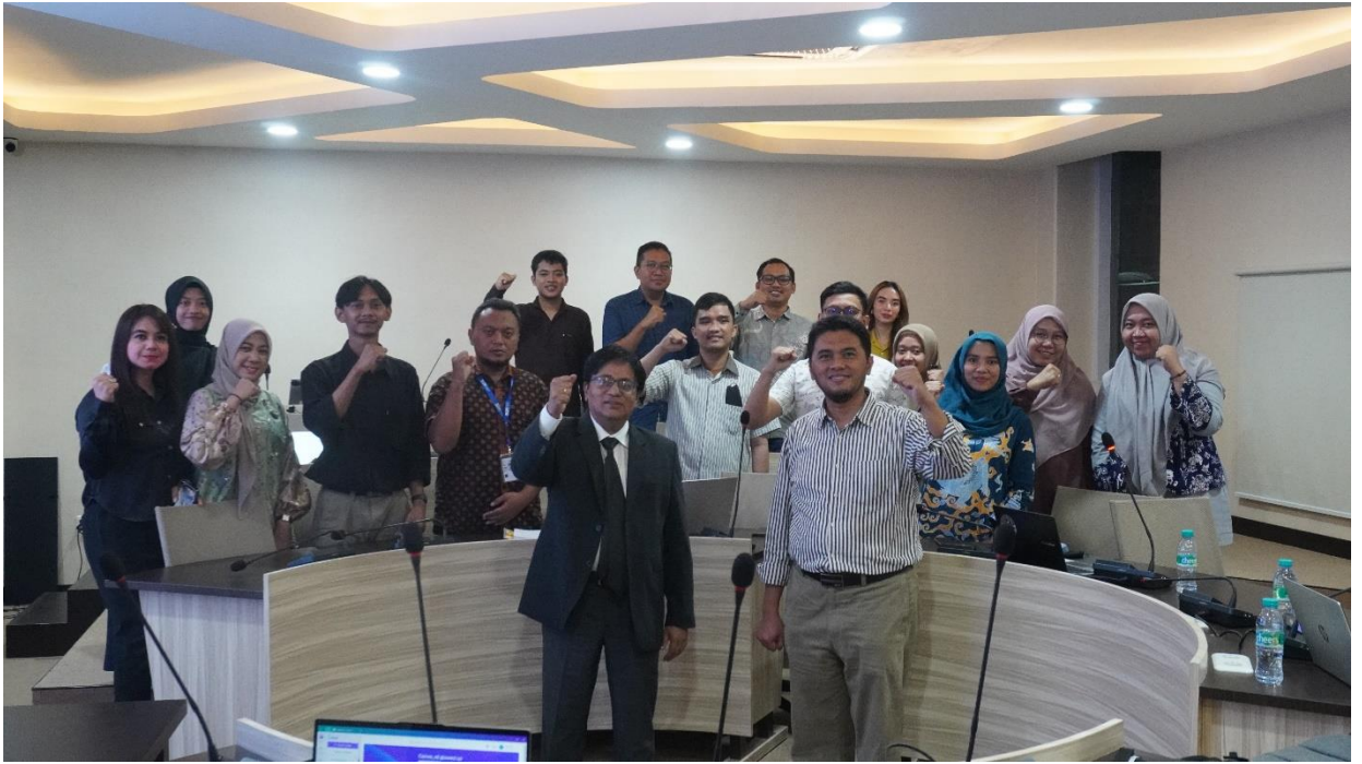
With the students of Post-Graduate and Doctoral studies after my talk on Development: Good Governance and Human Rights