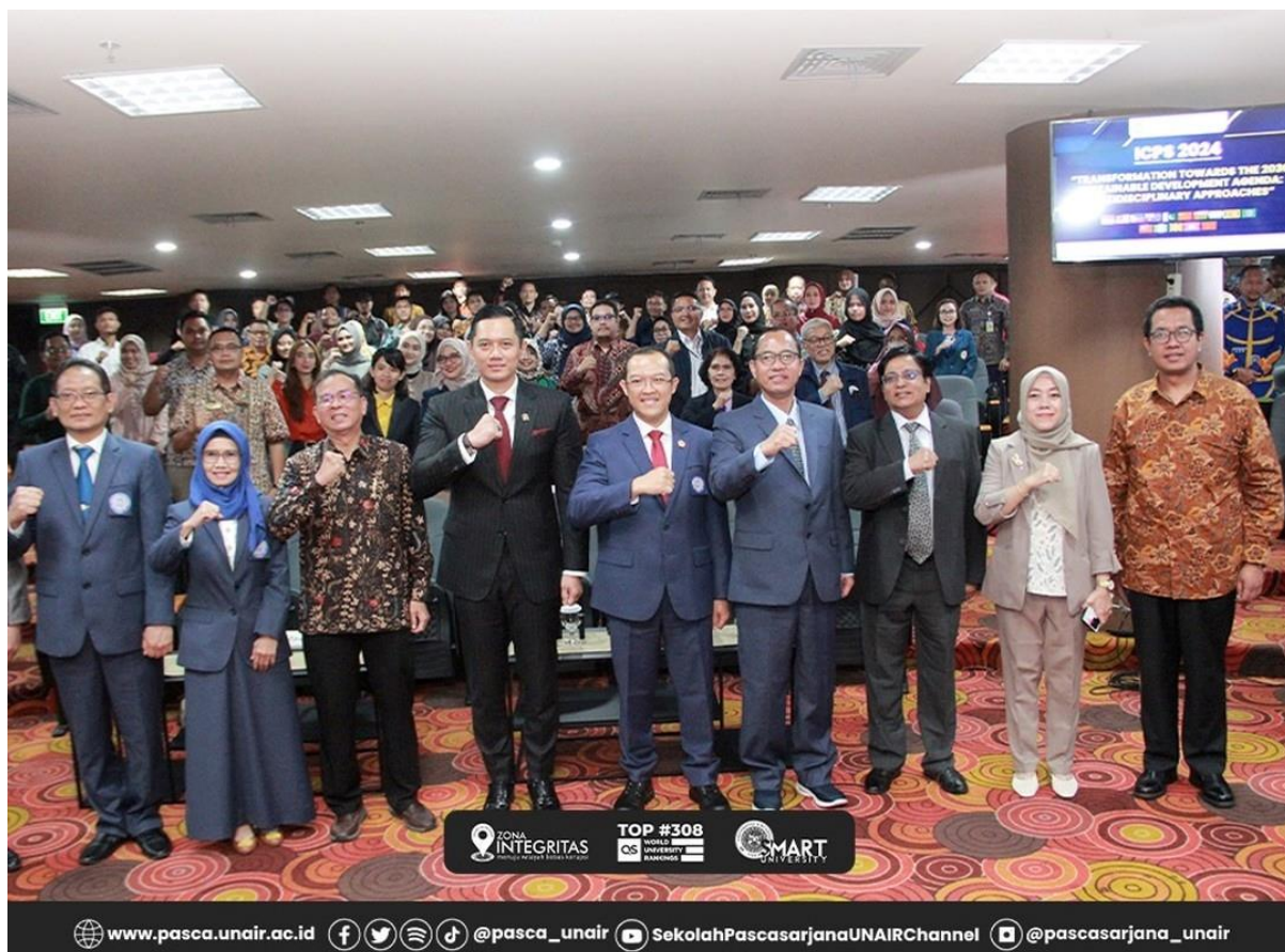
Group photo with all the chief officials of the Universitas Airlangga and guest speakers with H E Dr. H. Agus Harimurti Yudhoyono, the Minister of Agrarian Affairs and Spatial Planning/ Head of the National Land Agency