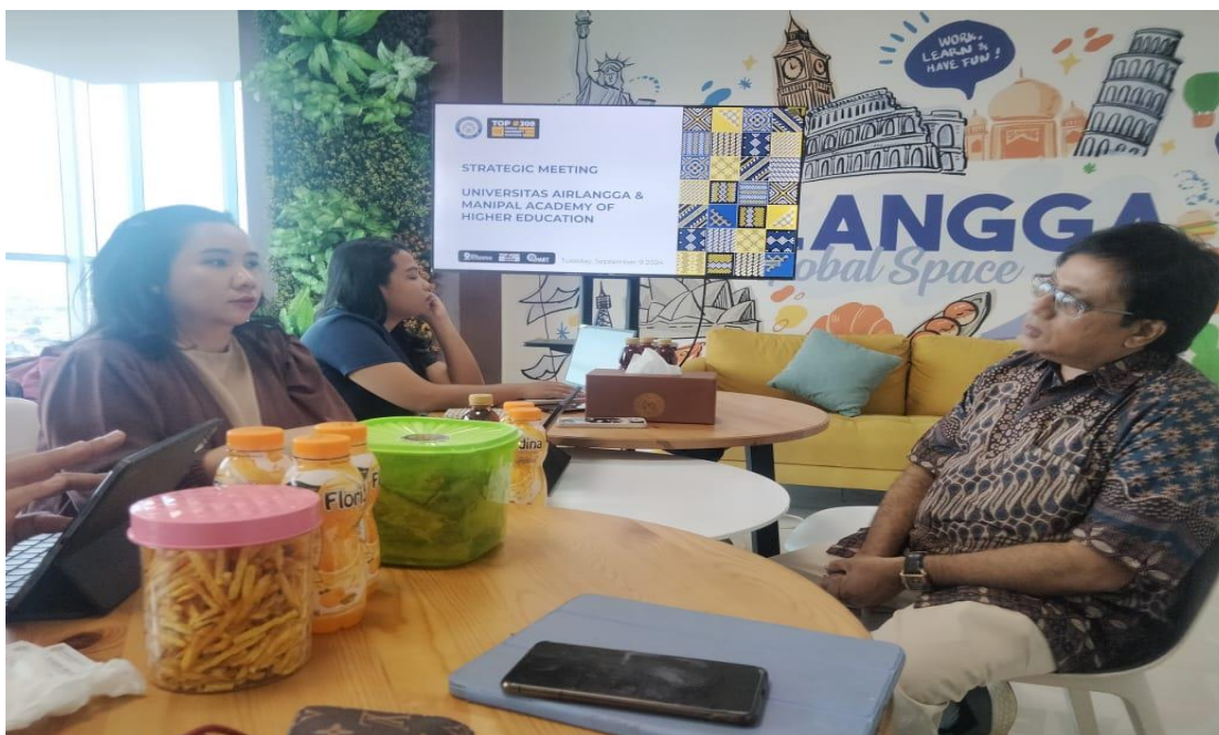
Strategic Meeting with the International Office for an active collaboration between the Faculty of Law and MLS