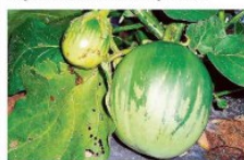
Mattu Gulla is grown in select villages in Udupi district.