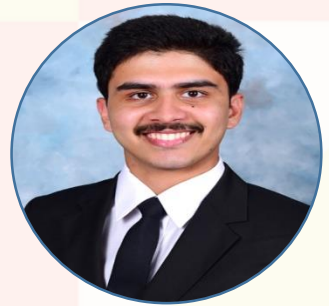
Devvrat Course Rep. MSc. HTM 9 th Course