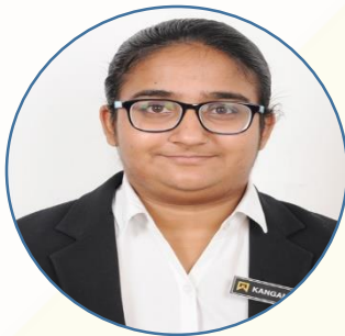
Kangana Course Rep. DOCA 5 th Course