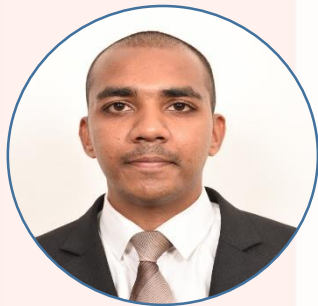
Preetham Course Rep. MSc. HTM 10 th Course